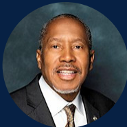
Senator Darryl Rouson, JD Florida Senate, District 16