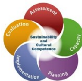
SAMHSA Strategic Prevention Framework (SPF)